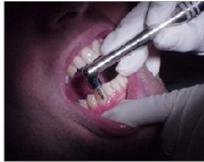
Dentist treating periodontal disease

The study looked at 366 pregnant women who had periodontitis in Alabama. Those who were treated with scaling and root planing before they reached the 35-week stage of their pregnancy reduced their chance of having a premature baby by 84%.