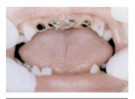
Early childhood caries.

arly childhood caries (ECC), or baby bottle \mathbf{L} tooth decay, is rampant caries in the primary teeth of infants and toddlers. ECC is caused by frequent and prolonged exposure of the teeth to sugar and the bacteria Streptococcus mutans. This exposure is often the result of a child going to bed with a bottle or drinking at will from a bottle during the day. The relationship between a mother's oral health and that of her infant is important. Dental caries is an infectious disease, and reducing a mother's cavity-causing bacteria will limit the amount of bacteria that is passed on to her baby.1 Most cases of ECC are preventable, but early detection is necessary